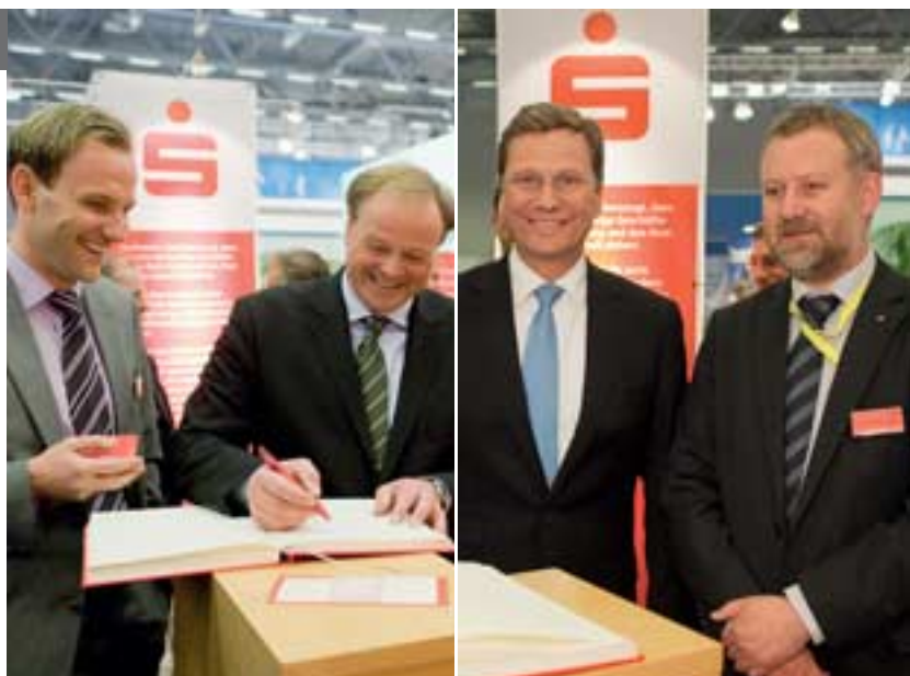
Germany's Minister for Economic Cooperation and Development, Dirk Niebel, and Foreign Minister Guido Westerwelle were able to find out more about Sparkassenstiftung's work at the GUT.-stand.

The Deutscher Sparkassen- und Giroverband (German Savings Banks Association) has a presentation stand for use at various events. Called the 'GUT.' (GOOD) stand, it offers Sparkassenstiftung an excellent opportunity to provide ministers, MPs and other multipliers with information about its work in the development cooperation sector. In 2010, Sparkassenstiftung used this stand to put in an appearance at the party conferences of Germany's Liberals, (FDP), Social Democrats (SPD), Conservatives (CDU and CSU) and the Greens.